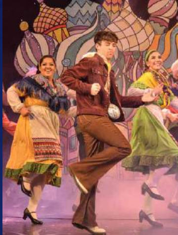
Greenwich Theatre's production of Sleeping Beauty in 2019

It's a joy to be doing Panto for you again (Oh, yes, it is!) and I can't wait to see you, our panto family, beaming back at us from your seats! Much love!