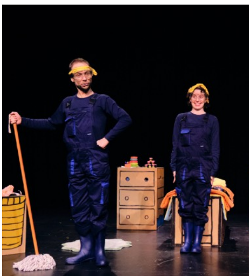
The two servants

These are the characters which are played by performers.