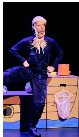
The Sea Captain